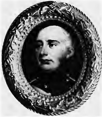
H. R. H. The Duke of Kent From the miniature at Windsor Castle